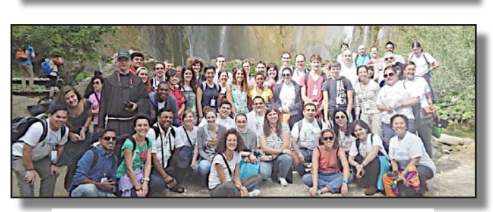
Second YouFra International Assembly - Croatia 2014