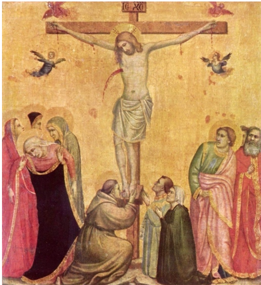
Giotto di Bondone: The Crucifixion, ca. 1303-1313

Sacred Scripture gives us the setting for all this. St. Paul writes in his Letter to the Philippians (2:6-11) : “Who, though he [Christ Jesus] was in the form of God, did not regard equality with God something to be grasped. Rather, he emptied himself, taking the form of a slave, coming in human likeness; and found human in appearance, he humbled himself, becoming obedient to death, even death on a cross. Because of this, God greatly exalted him and bestowed on him the name that is above every name, that at the name of Jesus every knee should bend, of those in heaven and on