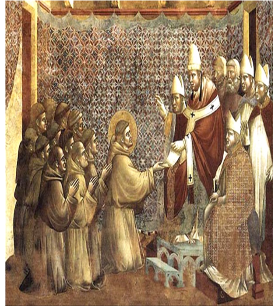
Giotto di Bondone: Confirmation of the Rule, ca. 1295

O God, who have sent the power of the Gospel like leaven into the world, grant that your faithful, whom you have called to live amid the world and its affairs, may be fervent with the Christian spirit and, through the tasks they carry out in this present age, may constantly build up your Kingdom. Through our Lord Jesus Christ, your Son, who lives and reigns with you in the unity of the Holy Spirit, God, for ever and ever. Amen. 2