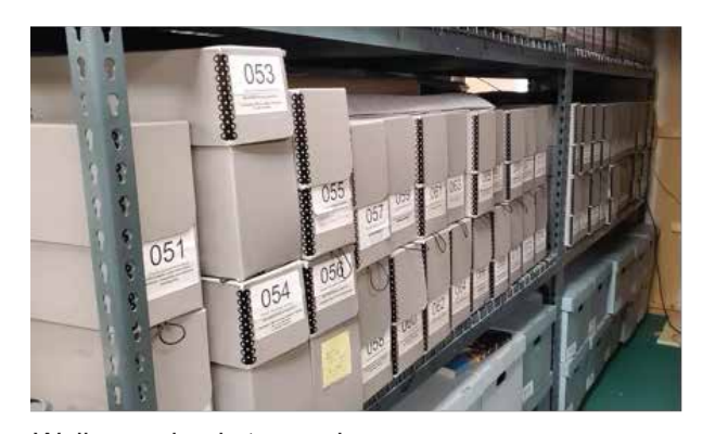
Well organized storage boxes.