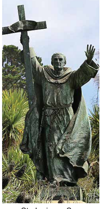
St. Junipero Serra Apostle of California

The region is culturally diverse with four Hispanic fraternities, two Korean fraternities, and one Chinese fraternity, which is the only one in the nation.